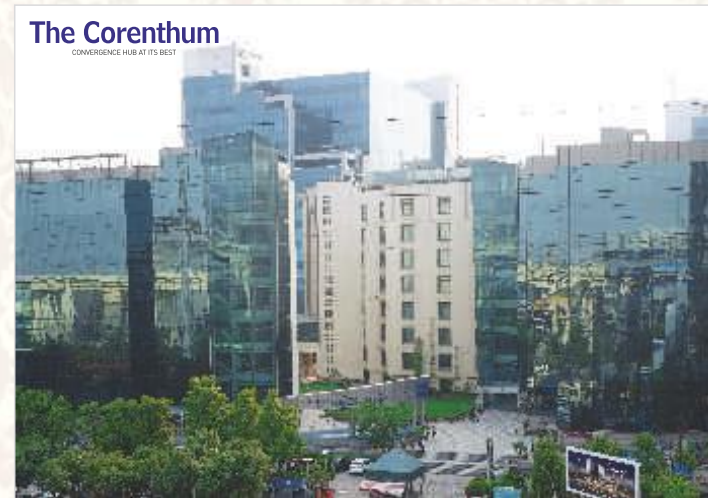
CORPORATE PARK | Sector 62, Noida