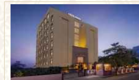
The Hideaway HOTEL Located at Knowledge Park I, Greater Noida