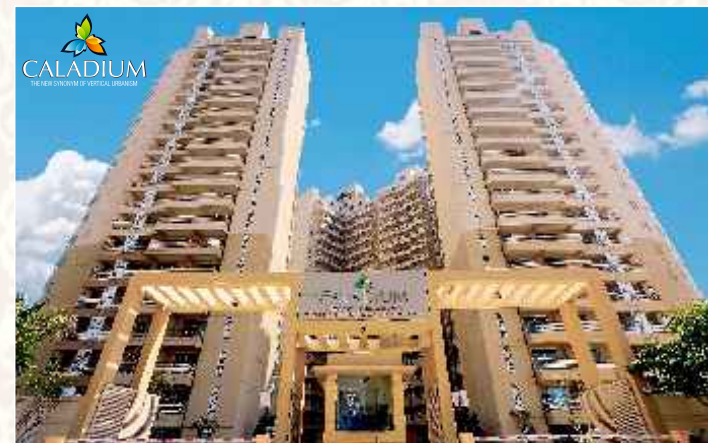
Sector 109, Gurugram | 3 & 4 BHK Apartments & Penthouses