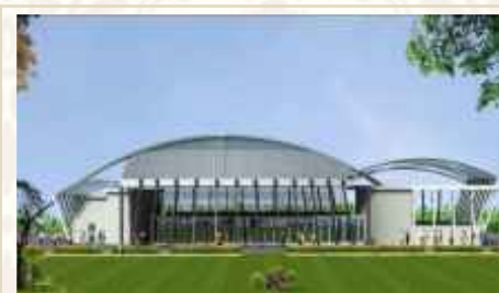
Ice Skating Rink & Indoor Stadium STADIUM Located at Raipur, Dehradun, Uttarakhand