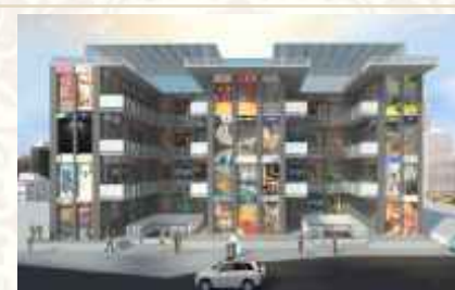
Delta City Centre SHOPPING CENTER Located at Sector Delta-1, Greater Noida