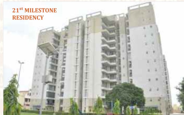
Rajnagar Ghaziabad | 2 & 3 BHK Apartments