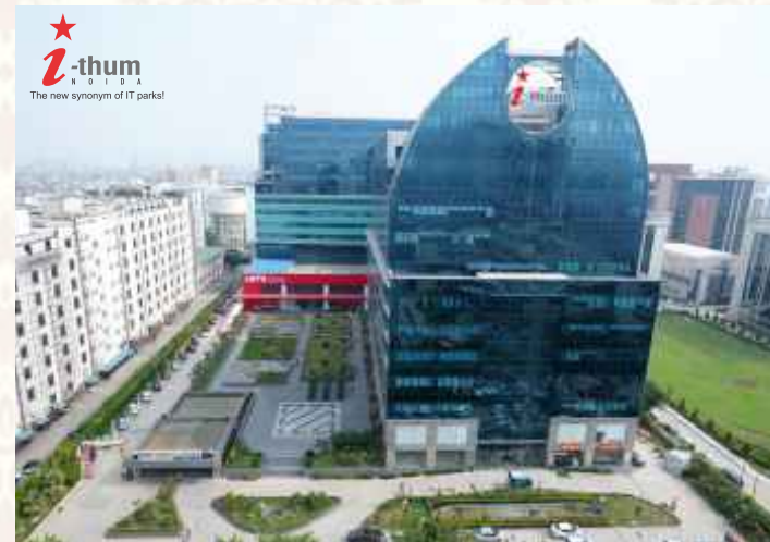
IT/ITeS / COMMERCIAL | Sector 62, Noida