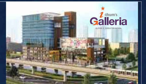
Alpha II, Greater Noida