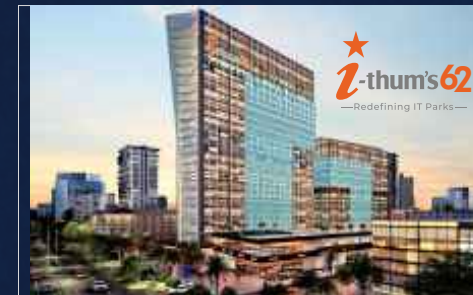
Sector 62, Noida