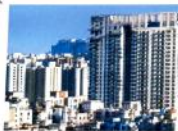
Catchment area of over Half a million households within 5km radius