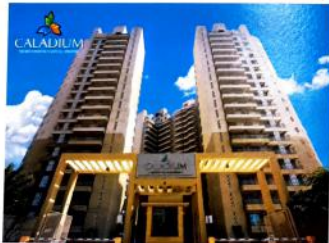
3 & 4 BHK APARTMENTS & PENTHOUSES

I-Thum World, a renowned name in the real estate market with more than three decades of experience in the realty sector, has developed many residential and commercial projects. The company deals with commercial spaces that include high street shopping complexes, Malls, and ITES Projects. Innovation, modern technology, world-class architecture and client satisfaction are the key factors behind the strength and exponential growth of the company. Our delivered residential and commercial projects in Delhi NCR are a testament to our expertise in the real estate domain.