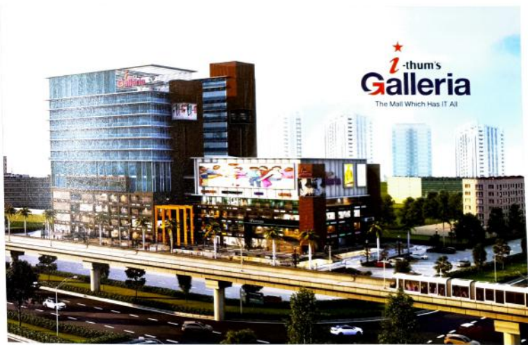
IT/ITeS / COMMERCIAL | Located at Plot No. 04, Vikas Marg, Sector 73, Noida

i-thum's Galleria The Mall Which Has IT All