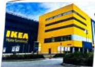
IKEA is all set to begin work of its biggest store in Noida