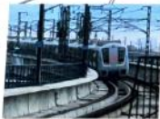
Noida Sector 52 - Metro Hub Smooth Connectivity to entire Delhi NCR