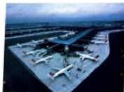
Jewar International Airport